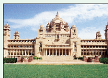
Umaid Bhawan Palace