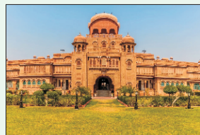
Camel City, Bikaner